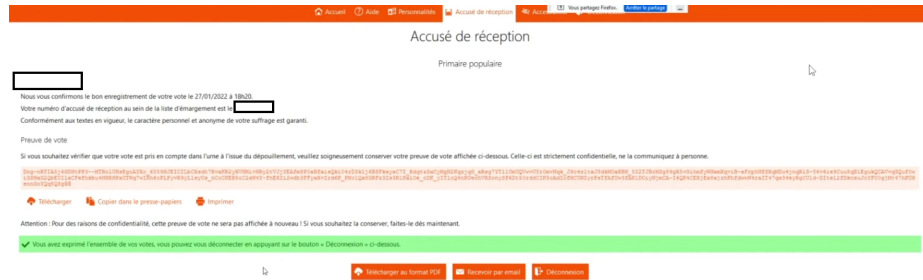
Fig. 3: The interface featuring the “proof of vote”, with personal identification removed (this was recorded while in a screenshare with the rest of the team). All the big buttons on the bottom close the page, and downloading the receipt requires clicking on the text below the “proof of vote”.